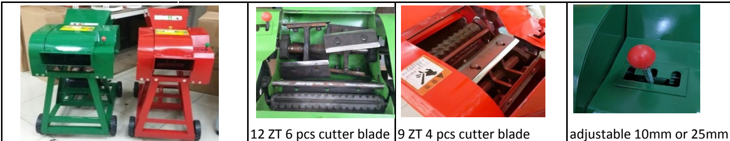
12 ZT 6 pcs cutter blade